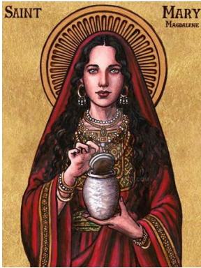
St Mary Magdalene