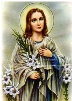
Saint Maria Goretti

Please pray for those who have recently died