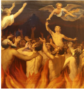
November: month of the Holy Souls

Please pray for those who have recently died