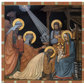
Adoration of the Magi