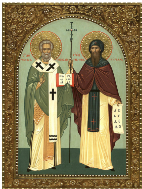
Ss Cyril & Methodius