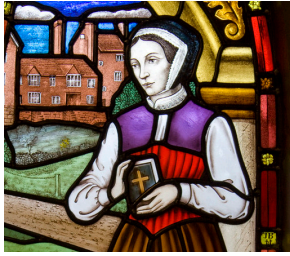
St Margaret Clitherow (English Martyr)