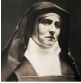
St Teresa Benedicta