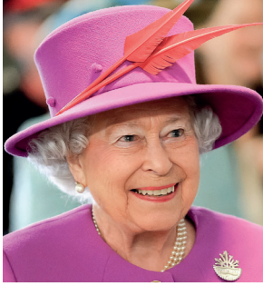
Her Majesty Queen Elizabeth II, 1926-2022. Requiescat in pace.