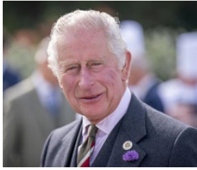
God Save the King