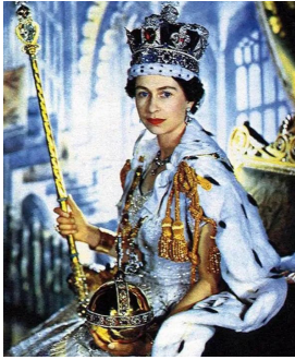
May she rest in peace