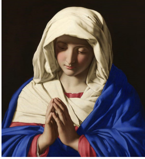
Nativity of Our Lady