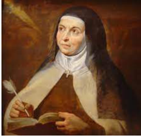
St Teresa of Avila