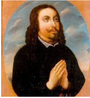
St Ralph Sherwin