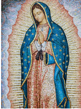
Our Lady of Guadalupe