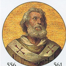
556 561 S. PELAGIUS I