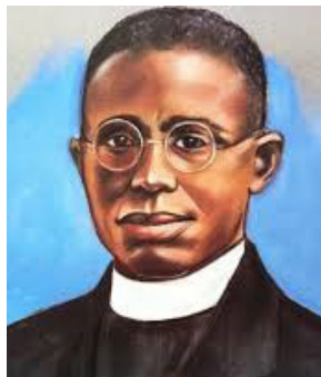
Blessed Cyprian Tansi