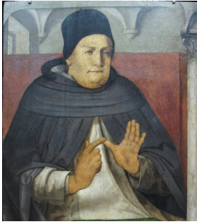
St Thomas Aquinas