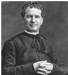
St John Bosco