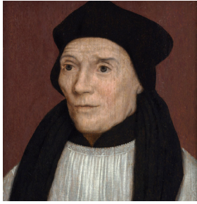
St John Fisher