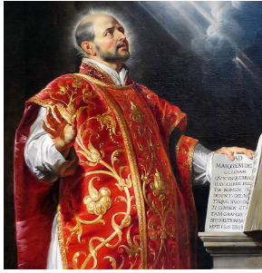
St Ignatius Loyola