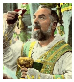
St Padre Pio