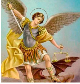
St Michael, 'Guardian of Purgatory'