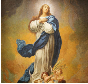
The Immaculate Conception