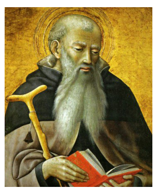
St Anthony of the Desert