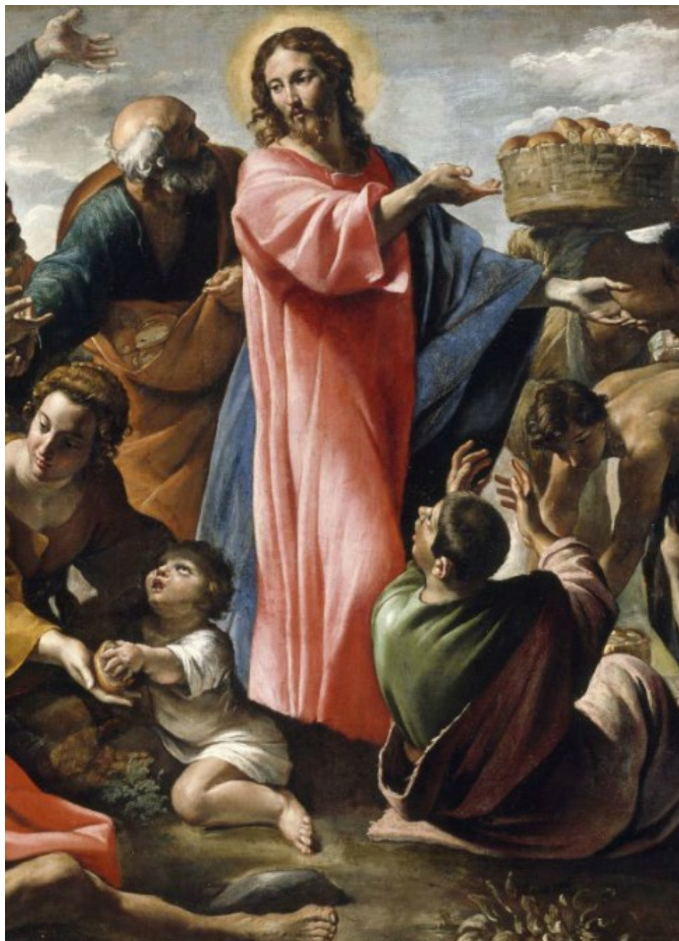
Miracle of the Bread and Fish (1620-23) by Giovanni Lanfranco / National Gallery of Ireland