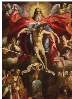
The Resurrection (1481) by Desiderius Erasmus