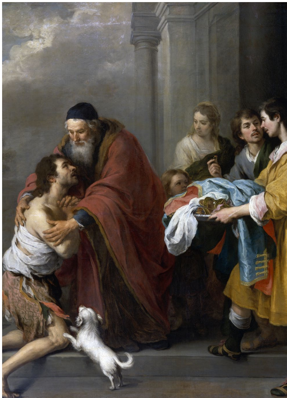
The Return of the Prodigal Son (c.1667-1670) by Murillo / National Gallery of Art, Washington DC