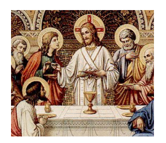
The Last Supper