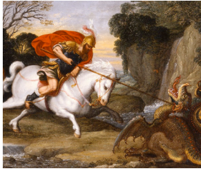
St George, Patron of England