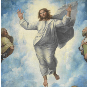
Ascension of the Lord