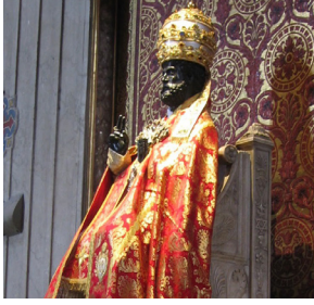
The Chair of St Peter