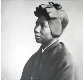
St Josephine Bakhita