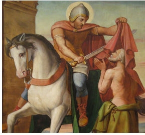
St Martin of Tours