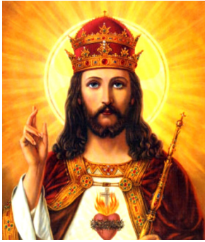
Christ the King