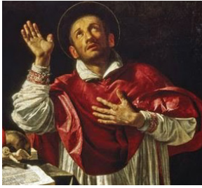
St Charles Borromeo