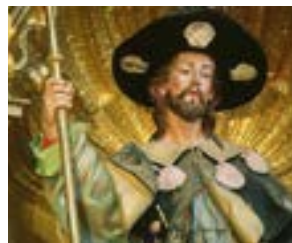
St James the Greater