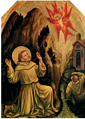
St Francis receiving the Stigmata