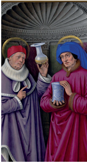
Ss Cosmas & Damian