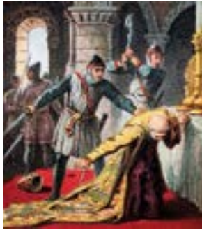
Martyrdom of Thomas of Canterbury