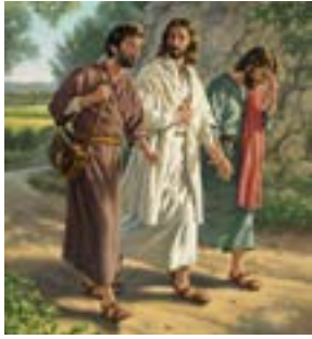
Road to Emmaus, Luke 24: 13-25