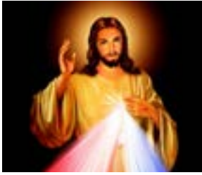
JESUS, I trust in You